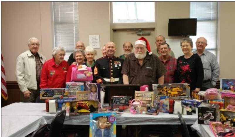
Collection for Toys for Tots at Chattanooga Chapter 108 meeting on December 12.